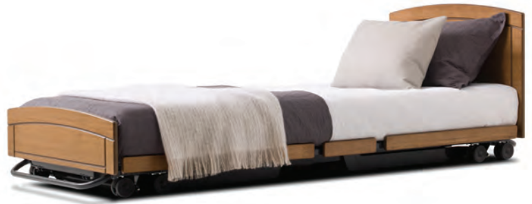
S LINE LOW BED - Milano Walnut Trim