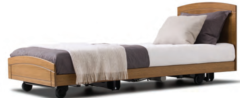
S LINE BED - Milano Walnut Trim