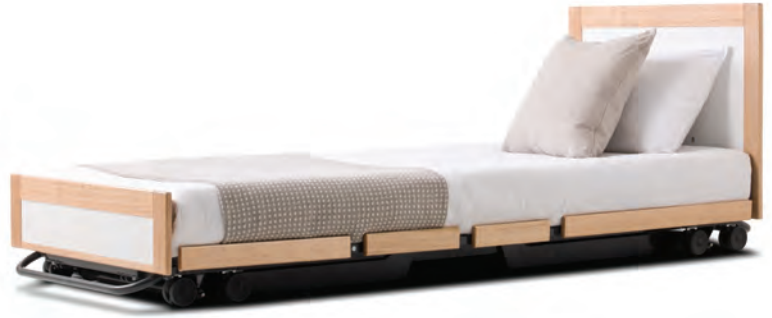
S LINE LOW BED - Light Birch Trim