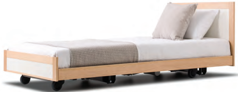
S LINE BED - Light Birch Trim